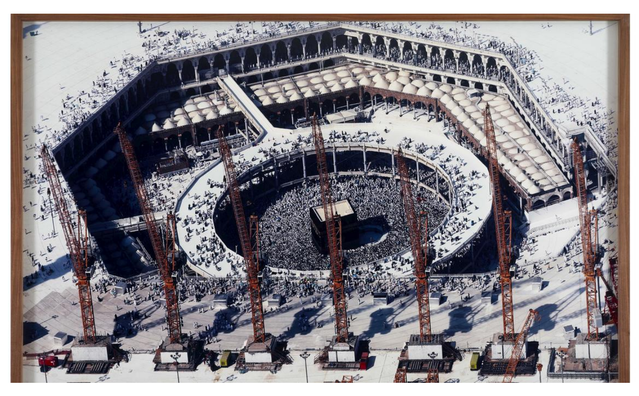
Ahmed Mater, Nature Morte, 2012, Laser chrome print on Kodak real photo paper, 124x177.5 cm, Edition 3/5, Courtesy of Ramzi and Saeda Dalloul Art Foundation

The beating heart of the Beirut Art Fair this year is an exhibition that is at once tragic and desolate, inspiring and uplifting. Ourouba: The Eye of Lebanon , curated by Rose Issa, also a London-based writer, seeks to answer a complex question: what does it mean to be Arab today?